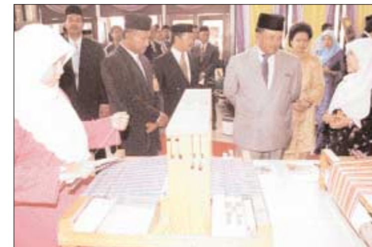
ROYAL ATTENTION .... The Yang di-Pertuan Agong Tuanku Syed Sirajuddin ibni Al-Marhum Tuanku Syed Putra Jamalullail visits a weaving exhibit after His Majesty's installation as Universiti Teknologi Mara (UiTM) chancellor on March 7 this year.