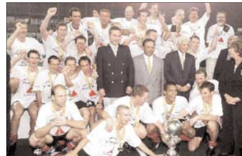
WORLD CHAMPS HONOURED ... The King with the German hockey team after the European side won the World Cup, which was held in Kuala Lumpur last month. On His Majesty's left is Perak Sultan and Malaysian Hockey Federation president Sultan Azlan Shah.