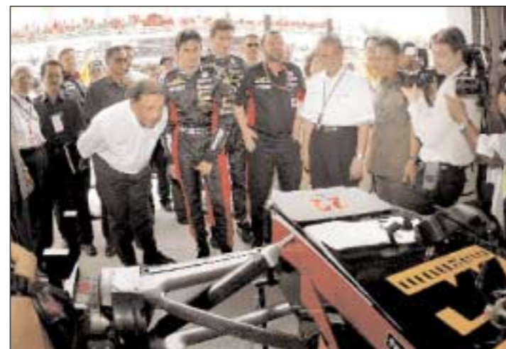
MALAYSIA'S OWN ... The King takes a closer look at the KL Minardi Formula One car at the Sepang F1 circuit early last month during the Petronas Malaysia Grand Prix. Looking on are Deputy Prime Minister Datuk Seri Abdullah Ahmad Badawi, Minardi team principal Paul Stoddart and drivers Mark Webber and Alex Yoong.