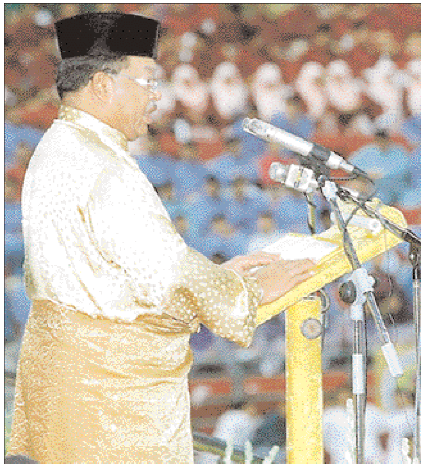
HEAD OF ISLAM ... The King addresses the about 5,000 crowd during the national level Ma'al Hijrah celebrations at the Stadium Putra in Bukit Jalil last month.