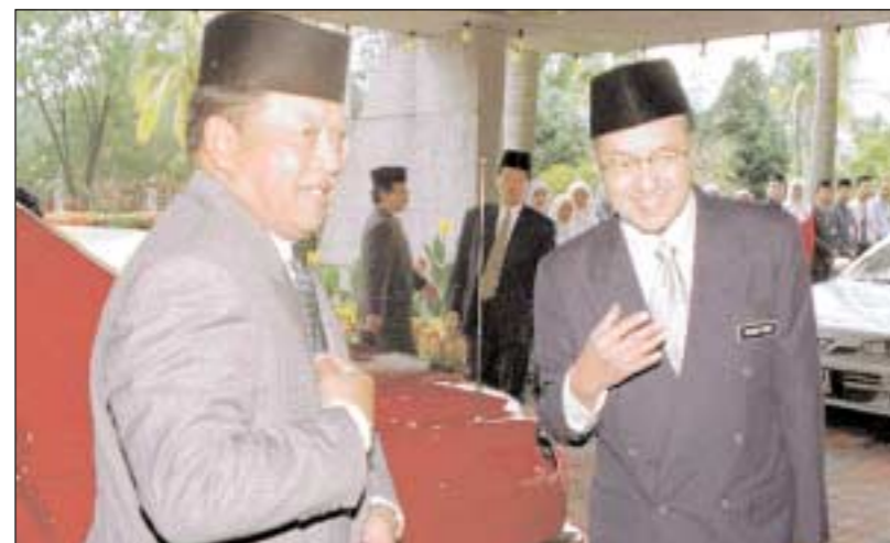
WELCOME.... The Yang di-Pertuan Agong is greeted by Prime Minister Datuk Seri Dr Mahathir Mohamad on his arrival at the Finance Ministry early this month.