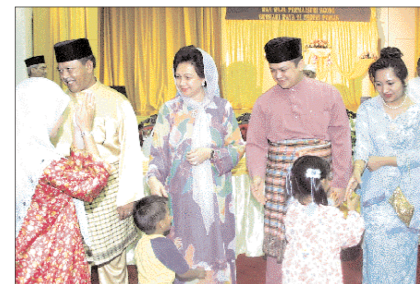
OPEN HOUSE ... (from left) The Yang di-Pertuan Agong, Raja Permaisuri Agong, Raja Muda and Raja Puan Muda of Perlis receive well-wishers at Dewan Warisan in Perlis during a Hari Raya open house in December last year.