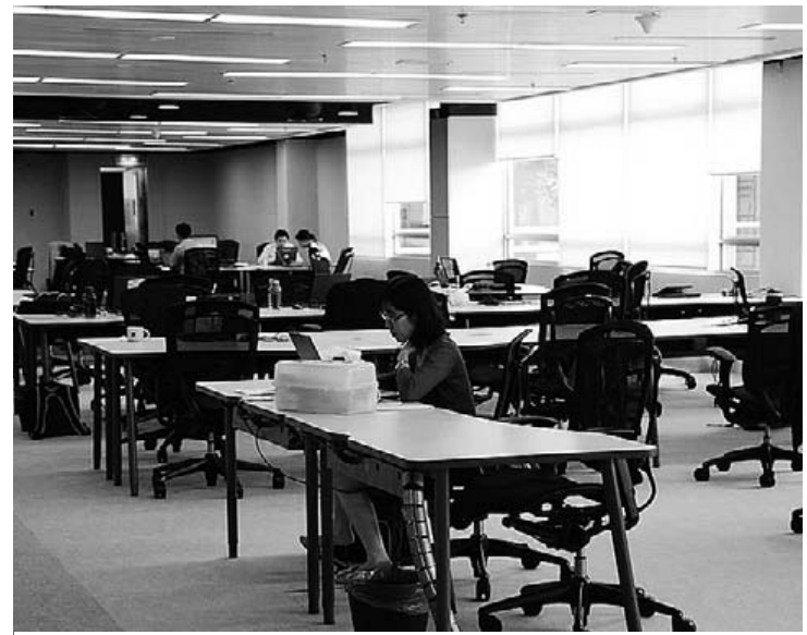
One of the many work areas in D'House. There are no partitions and each day, staff can choose to sit anywhere they like